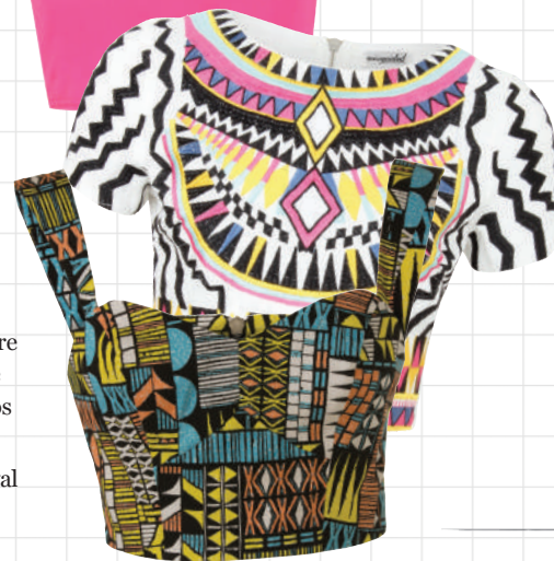
From top: Pilot; Missguided; Penneys